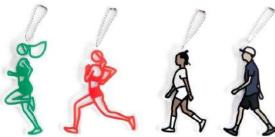
Acrylic Keyring 1,650 yen (tax included)