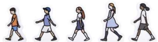
Capsule toy 500 yen (tax included) ※All 5 types available via closed lottery system.