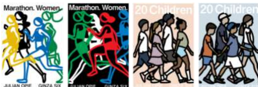
Poster A size: 2,750 yen, B size: 3,300 yen (tax included)

※All items are available in a limited quantity. ※Product images are for illustrative purposes only.