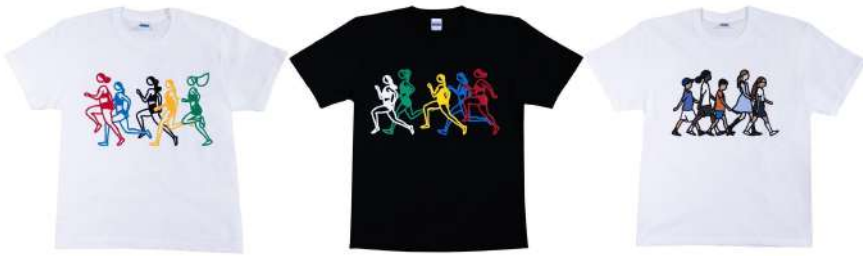
T-shirt 6,930 yen (tax included)