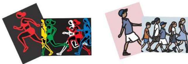
Stickers (Marathon. Women. 2types, Children 2types) 550 yen (tax included)