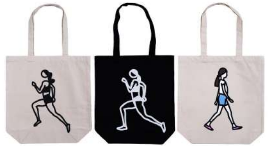
Tote bag 4,180 yen (tax included)