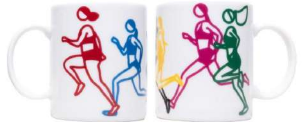
Mug 4,950 yen (tax included)